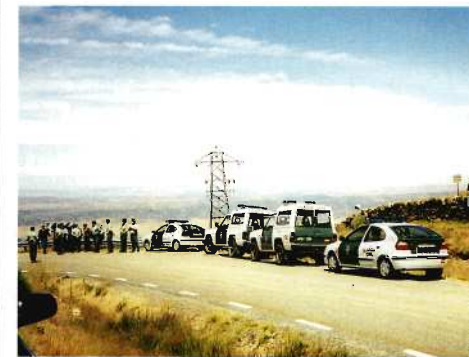
The local cops keep a relaxed eye on territorial hostility